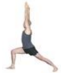
Warrior 1 (but back foot should be pointing forward, with toes slightly inward as in Tadasana, and heel on the floor)

“In the last few weeks, with the pandemic still expanding, you’ve lost some of your external pathways to bliss. The people, places and things you’re used to focusing on are not so easily available, perhaps not available at all. ... Though you’re currently in seclusion, you’re probably looking forward to the time when you get out in the world and reinstate your old pathways to bliss. Instead, I want to help you find new pathways, ones that work for you, both while you are homebound as well as when your life gets going again. They’ll work better for you than anything else you’ve ever tried.”